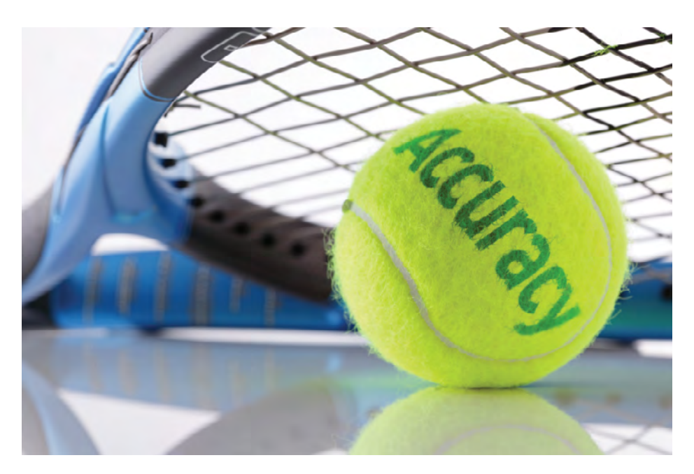
Are you an accuracy ace?